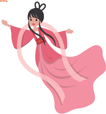
嫦娥 cháng é Chang E