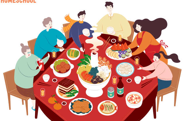
团圆 tuán yuán Reunion