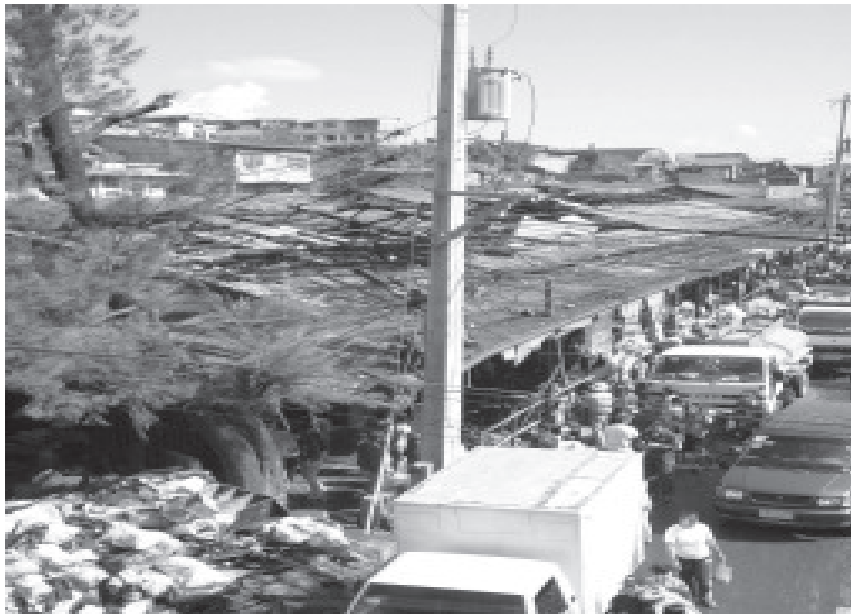
BAGUIO CITY-- It doesn't look as bad from the outside but the sari-sari section of the public market here was all burnt wood, goods and other combustible items during the freak one and a half hour fire dawn Friday. "Notice the ulgy dangling wires above it that allegedly caused the fire.

BAGUIO CITY Easier said than done, but solving the peoples woes including poverty is the best antidote against insurgency, Cordillera political leaders said during the two-day Peace and Security Assembly,