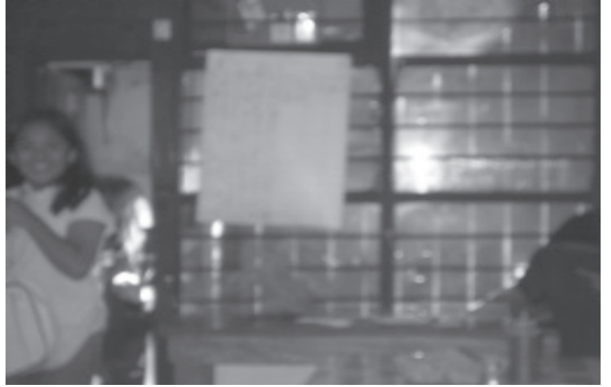
TAYAAN NG JUETENG ANYONE??? This photo was taken by one of our informers who also said that this Jueteng betting station located at Unit No. 5 Lopez Bldg, Kayang St. (located right at the heart of the Central Business District) is alleged to be one of the strongest betting stations for the illegal numbers game (Jueteng). For more details see LG Komentaryo, p.7.