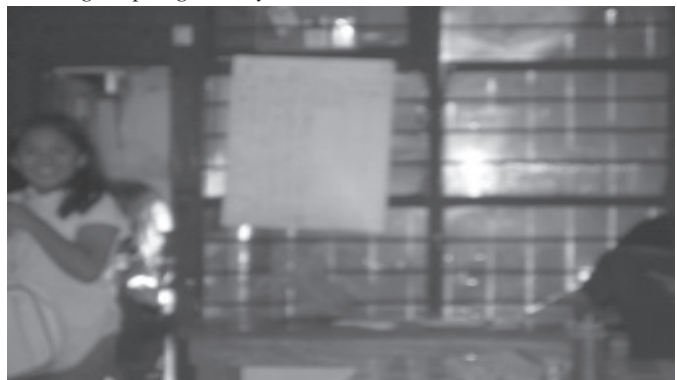
Napakadaling tumaya, may mga guides pa sa mga nakaraang numerong labas. O ano pa inaantay ninyo, halina na, tara na at magsi-tayaan na tayo!!!