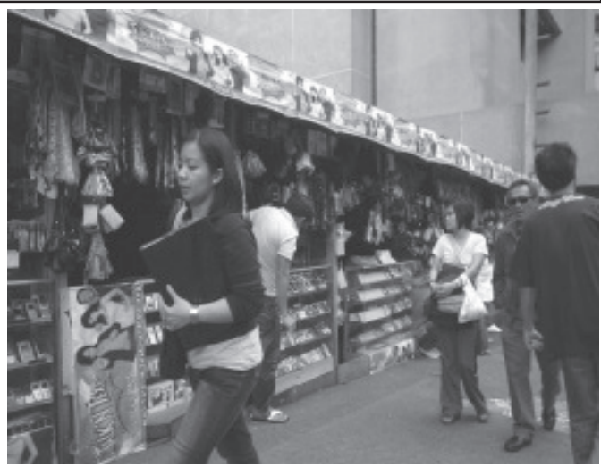
BAGUIO CITY -- Ironic reality!The local government's tact against illegal vendors plying the streets and sidewalks merits commendation but how about also illegal stalls getting "ninongs and protectors" allegedly from city hall sprouting all over the city including Session Road like this at the Session Road ruins. Are they untouchables because of the protection? -- Artemio A. Dumlao

"According to the records of the Animal Bite Center of the Health Services Office, the number of dog bite cases reported to their agency alone is 1,501 cases for the year 2005. The number of cases for 2006 (January to November) is 1,551 cases surpassing the number of