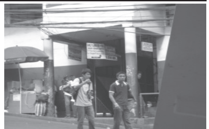
Entrance to Lopez Bldg. Along Chugum St. corner Kayang St. for easy betting, Come one come all, hindi na kailangan pang lumayo!

BARIP is under the Cordillera Road Improvement Project funded by the Japan government through Japan Bank for International Cooperation (JBIC) and the Philippine government./ PIA-Benguet