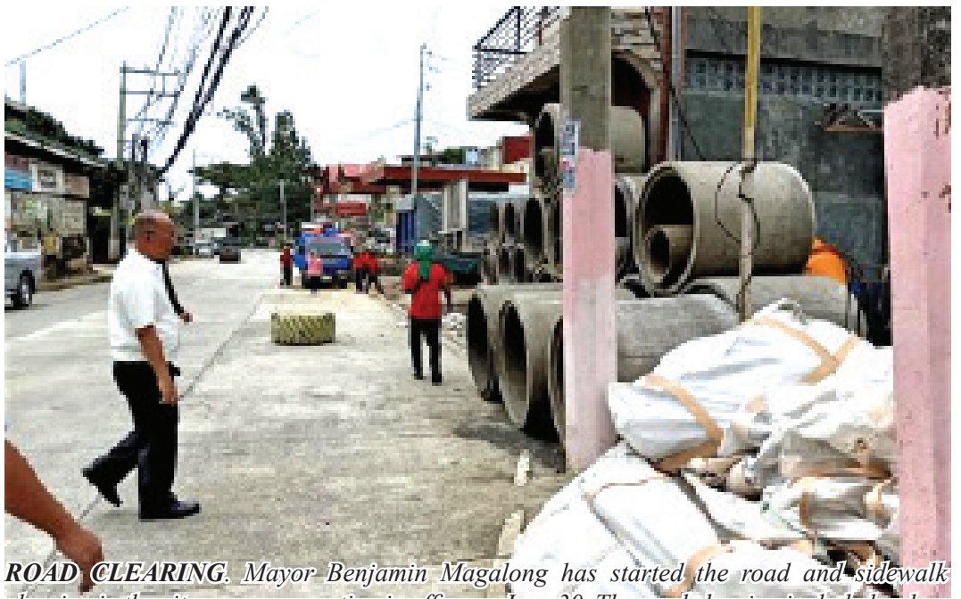
ROAD CLEARING. Mayor Benjamin Magalong has started the road and sidewalk clearing in the city upon assumption in office on June 30. The road clearing included orders to contractors to clear the debris obstructing roads or face sanctions.

After the lapse of the deadline of the notice to vacate issued to the tenants of the Magsaysay building, Degay disclosed the city government will execute the demolition of the Cont. on page 3