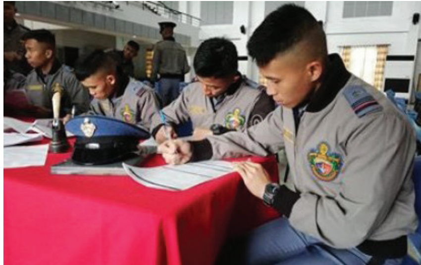
OFF-SITE VOTERS REGISTRATION. A total of 11,126 voters availed of the two-month special registration from Aug. 1 to Sept. 30. At the Philippine Military Academy, 942 soldiers and cadets registered.

several off-site registration activities in schools, offices, and the Philippine Military Academy (PMA), where 942 cadets and soldiers registered.