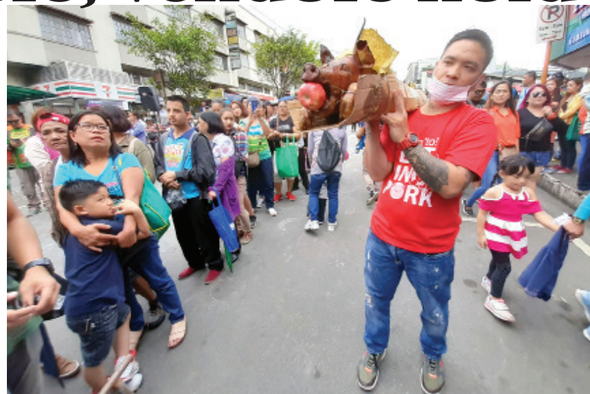
More than 3,000 residents and tourists in the city of Baguio partake of the the sumptuous lechon during the Baguio Lechon Festival along Session Road over the weekend. (RMC-PIA-CAR)

Meanwhile, the Hotel and Restaurant Association of Baguio will hold the "longest longanisa" parade along Session Road on Sunday, October 6 as a highlight of annual Hotel and Tourism Weekend. It is also a way to support the meat industry of the city. (JDP/RMC-PIA-CAR)