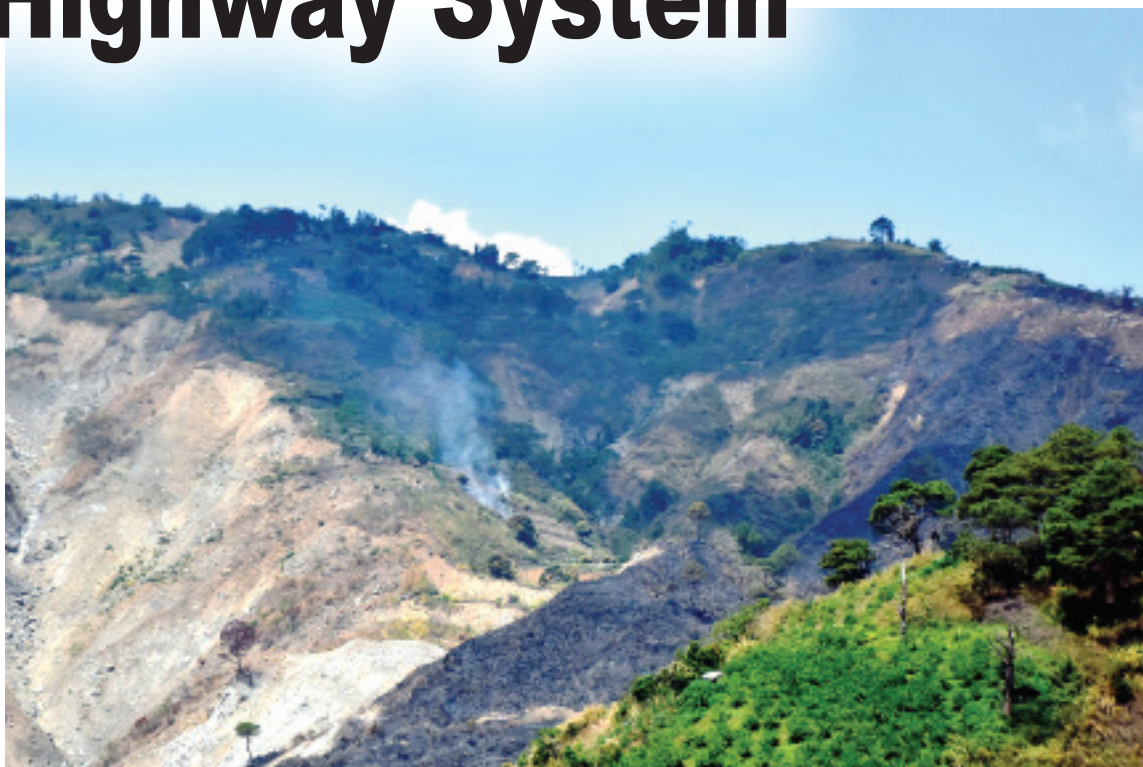
Santo Tomas fire - A grassland and forested portion of the Mount Santo Tomas in Tuba, Benguet was again on fire on Friday last week. DENR Regional Director Ralph Pablo called on the public to stop burning the grasslands and forest lands for farming purposes since it poses threat to the environment with the massive forest fires experienced in the Cordillera Region.

The highest Point in Atok, Benguet was established since the construction of the national road after the second World War. The Kiangnan-Tinoc-Buguias Road was only converted into a national road by virtue of Republic Act No. 10551 in May Cont. on page 3