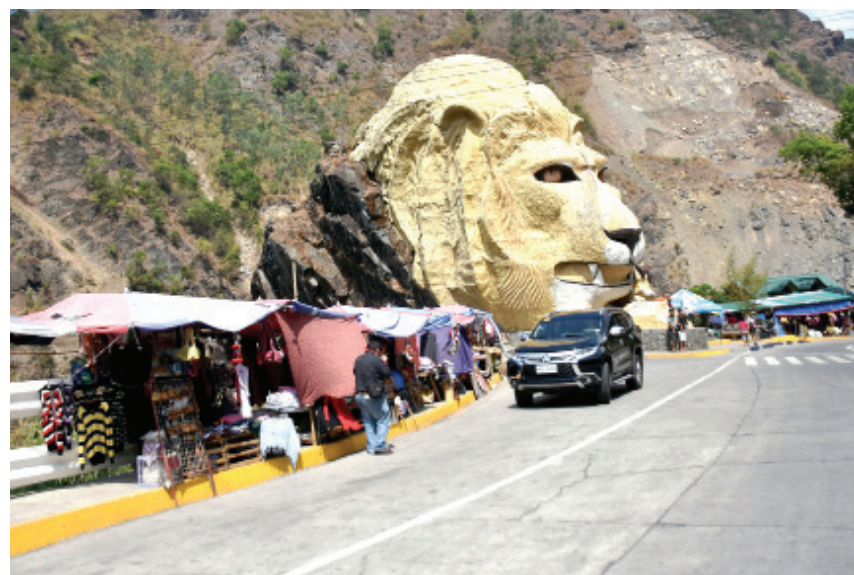
Kennon Road Stalls - Illegal vendors are back at the Lions Head along Kennon Road following the temporary opening of the historic road during the weekends with the recommendation and approval of the Kennon Road Task Force and the Cordillera Regional Disaster Risk Reduction and Management Council.