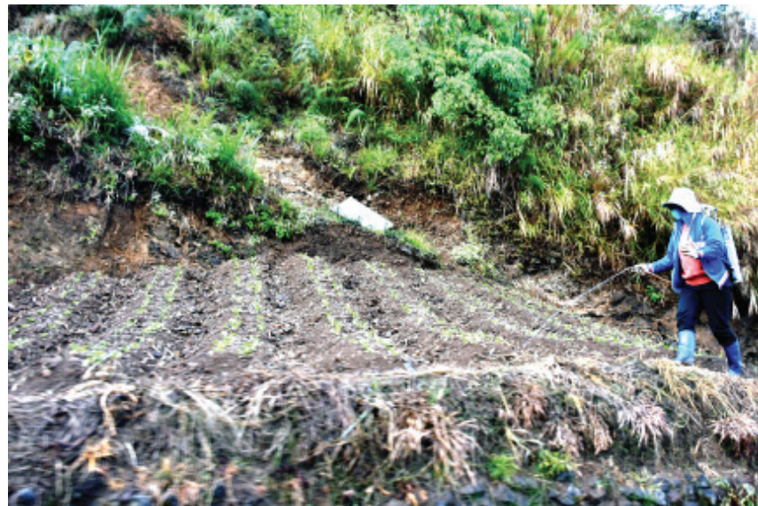
BAUKO VEGGIE FARM - Many farms in the lowlands and even in some parts of the Cordillera are experiencing drought due to the effect of El Nino but most farms in Bauko are still surviving with the abundant supply of water from the forested areas of the municipality. Here, a farmer waters her vegetable plants along Bauko, Mountain Province.

He revealed there were 45 police operations against illegal drugs wherein 40 persons were arrested and the seizure of 80.89 grams of shabu as well as the uprooting of 143,434 marijuana plants and the confiscation of 83.97 kilos dried marijuana leaves worth over P39.2 million that resulted to the filing of 25 cases with 32 surrendered drug personalities regionwide. /Dexter A. See