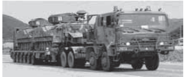
South Korean Army's heavy armored vehicles are carried during a military exercise near the border village.

A list of proposals was sent Wednesday to the five permanent veto-wielding council members—the United States, Russia,