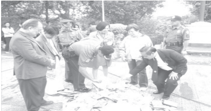
PORNO NO MORE - City officials headed by OIC Mayor Daniel Farinas and City Police Director Enrico Salapong break into pieces "Kho-Halili" and other pornographic video discs as part of the city's anti-pornography drive during simple rites last June 1 at city hall grounds.

Opposition Sen. Chiz Escudero yesterday said the House of Representatives cannot change the constitution through a constituent assembly without the consent and participation of the Senate.