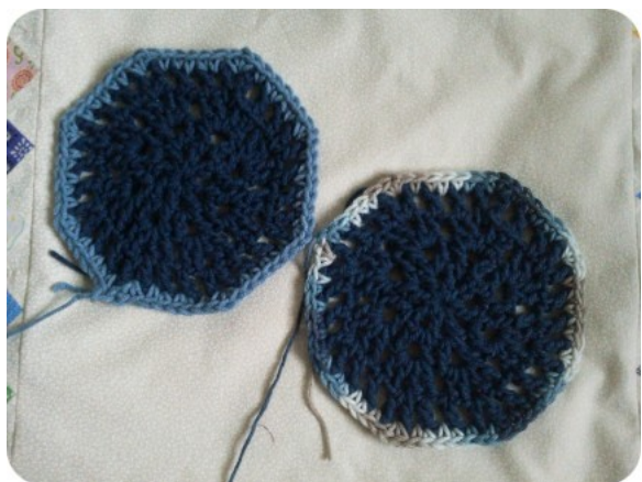
Cape Cod MC shown with Azure (left) and Country Basket (right)

Flowerish Octagon was originally designed for this blanket: Stop in the Name of Love. As of June '21, the blanket pattern is yet unpublished.