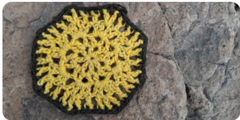
Sample using medium weight yarn from unraveled wool sweaters