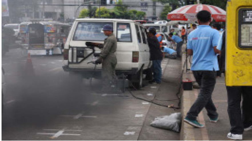
"BLACK IS BLACK" – Members of the Roadside Inspection, Testing and Monitoring Team (RITMT) tests a government vehicle at Harrison Road during the conduct of 'Free Emission Testing' last April 27 at Harrison Road.

Senate minority leader Alan Peter Cayetano said that what is far more important than forming or joining coalitions at this time is for the voters and candidates to be assured that the improved automated system will further deter any attempt by known political operators to tamper with the results.