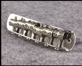
Stay-on type saddles