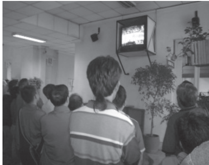
NBA BASKETBALL FANATICS - Basketball crazed Baguio residents doing business at city hall take their time-out to watch the live television NBA 1st Semi-Final elimination round between Los Angeles Lakers and San Antonio Spurs.

The neophyte senator said he believes there are other people who are a lot qualified and suitable to the job and who can command acceptability and respect to the parties involved in the peace agreement. "Although I have serious doubts about General Esperon, I wish him well since he welcomes the job in a tight embrace. Let us just hope that he can usher democratic transformation in the country's search for a long lasting reconciliation and peace./ Office of Sen. Chiz Escudero