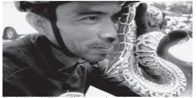
BAGUIO CITY -- The legendary Zuma is in Baguio? No, a just mere snake fanatic displaying his elaborately colored 9-month old Burmese python as he rides his bicycle around town as if taunting that man's best friend has become the snake and not anymore the dog.