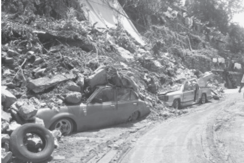
TYPHOON COSME'S PATH OF DESTRUCTION: Two vehicles were totally crushed caused by a landslide along BAH compound./ By Bong Cayabyab

BAGUIO CITY – The fate of PCSO's Small Town Lottery here will certainly again divide Baguio as attempts to ram in its operations are continuing.