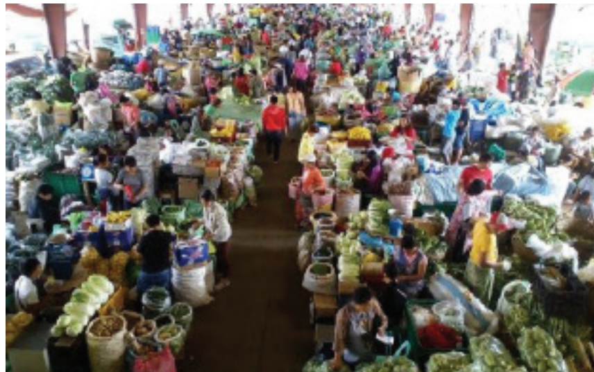
FRESH VEGGIES. The road reblocking along Marcos Highway that will be finished on December 21 causes heavy traffic at the major road to and from Baguio City. This causes a delay in the delivery of highly perishable vegetables that come from the trading post in La Trinidad to Metro Manila where the demand is expected to increase from 1.5 million kilograms to 4.5 million during the peak season in December.

The company is just one of the numerous project proponents that offered to the city government similar ventures the past several years and these had been subjected to scrutiny by technical