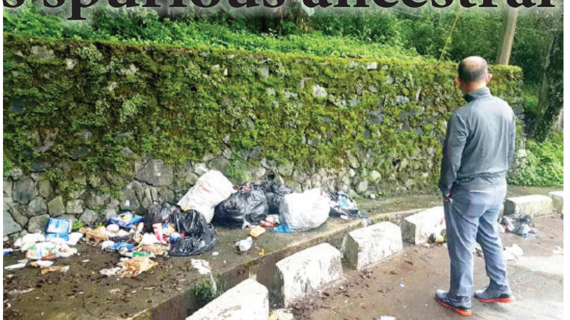
THE MAYOR AND THE TRASH - Mayor Benjie Magalong was deeply disappointed by the pile of trash along Loakan Road. The Mayor's Facebook page captioned this as "Mayor Benjie Magalong calls out barangay officials of Greenwater Village for their failure to inspect and clean a regular garbage dumping area along Loakan Road" for which residents and officials of the mentioned barangay cried foul, saying this area is not within Greenwater, and the trash is not from the residents as they have their designated and well-maintained collection area.

Ay sala-salamat Supreme Court. Abuso met ngamin dagitoy NCIP ta ipa-title da metten ti open spaces ti Baguio. Inayan kayo pay.