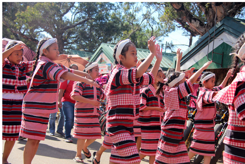
ONJON NI IVADOY - Ibaloi children in their native attire perform the "tayaw" street dancing during the 8th Ibaloy Day parade last February 23.