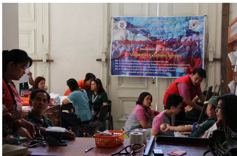
"TO SAVE LIVES" - City Hall employees donate blood during the Blood Letting activities at the city hall as part of the celebration of Government Employees Week.