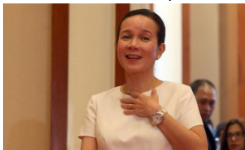
GRACE UNDER PRESSURE Sen. Grace Poe says she's ready for long fight ahead as her supporters hold a rally at the Comelec office in Intramuros, Manila.