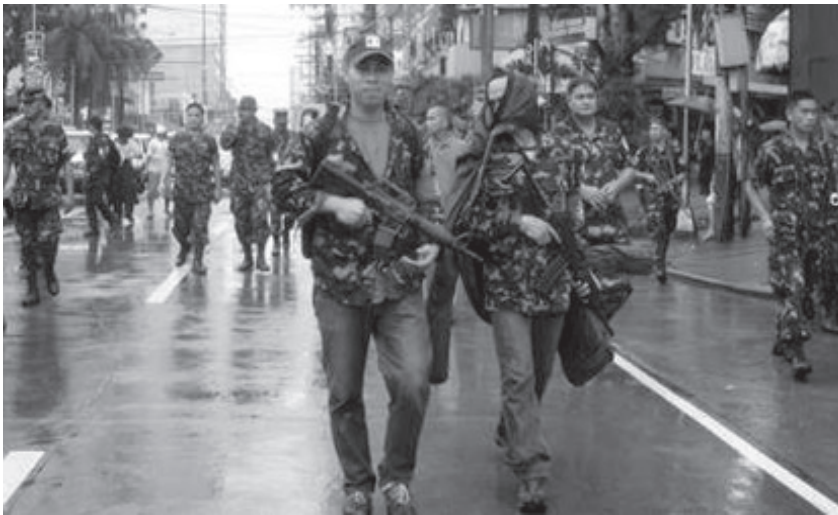
Soldiers supporting Army Brig Gen Danilo Lim, former vice president Teofisto Guingona and Sen Antonio Trillanes IV walks along the streets of Makati their leaders walked out of a court hearing in Makati City Thursday morning.

BAGUIO CITY – The “word war” between city officials over the controversial plan to buy cars has worsened.