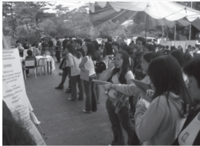
DOES THE UNEMPLOYMENT LINE EVEN GET SHORTER? Jobseekers line up in front of the Baguio Convention Center hoping, even against hope, they could finally become productive. With the multitude of jobs fairs all over the country held every year, it seems the line never really get shorter. The 2-day jobs fair was an undertaking by various companies in cooperation with the city government.

Transfer of telephone and Cont. on page 11