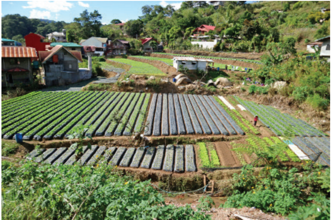
ONCE A VAST FARMLAND - The remaining farmland at Camp 7 which was once teeming with Baguio vegetable products including wild fauna and flora is now endangered due to the fast urbanization of Baguio City.

"Nonetheless, this is a welcome development in terms of our aim to reduce our dependence on plastic materials for environmen- Cont. on page 3