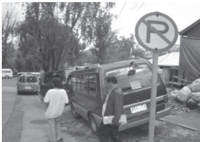
IN YOUR FACE !!! - The franchises of the garage vans (as shown in photo) along Otek Street should be cancelled by the proper authorities as they totally disregard the rule of the law and disobeying the Administrative Order 102 issued by Mayor Reinaldo Bautista, Jr. for using the pedestrian lane as their "exclusive" parking area./By Bong Cayabyab