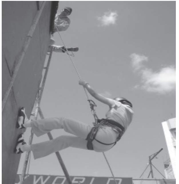
PREPAREDNESS IS FOR EVERYONE. An young lass tries out rappelling while members of the Baguio-Benguet Public Information Civic Action Group watches over her safety during the "Moving on" disaster preparedness exhibit by various volunteer rescue groups, July 16, which was in line with the July 16, 1990 Earthquake Commemoration activities at session Road.