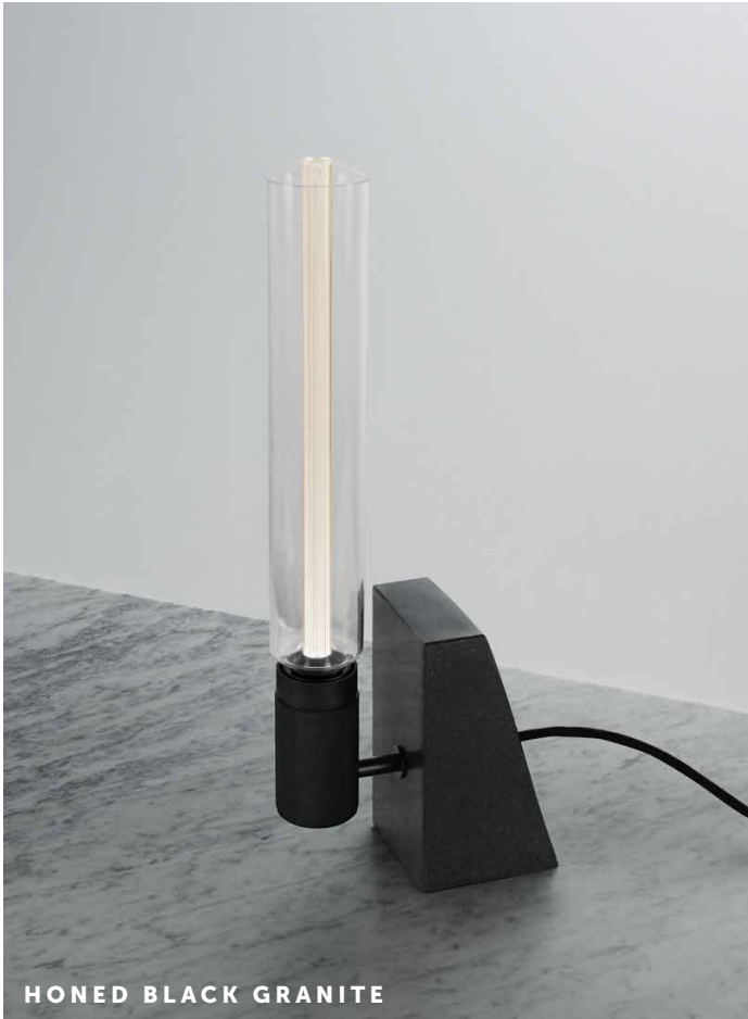
HONED BLACK GRANITE