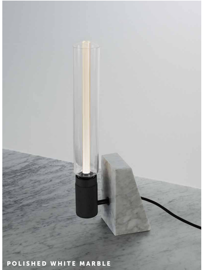
POLISHED WHITE MARBLE