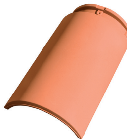
Half Round Tapered Overlapping Hip 15" Exposure