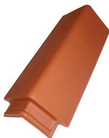
4 Way Apex