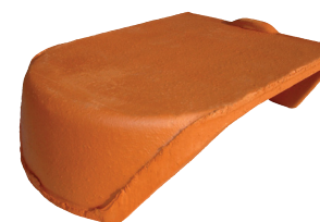
Clay Wedge Filler for Under Ridge & Hip Tiles