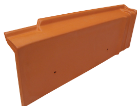
Right Hand Gable Rake