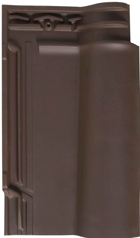
Tile Size: 18" x 10 3/4" Tile Exposure: 15" x 8 3/4" Pieces Per Square: 110