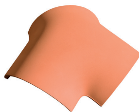
3 Way Apex