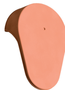
Half Round Ridge End