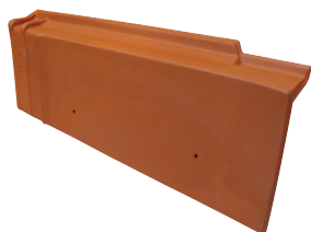
Left Hand Gable Rake