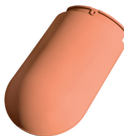
Half Round Hip Starter