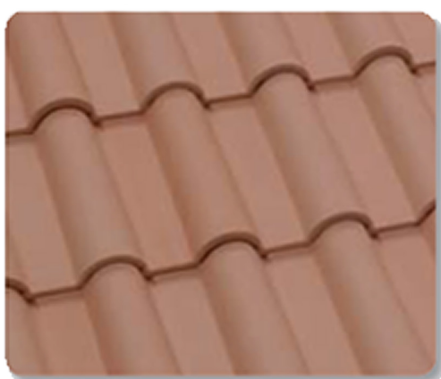
STRAW WHITE GLASS