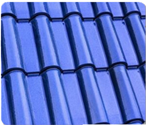
AZUL DUBAI BLUE