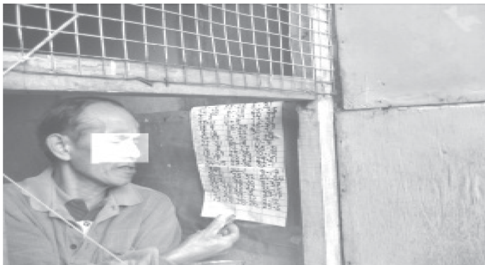
Above Photo taken at Rajah Matanda St.