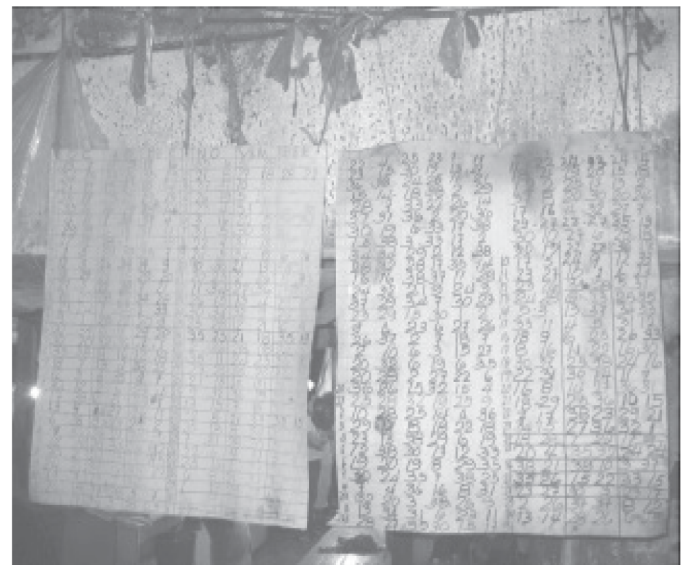
Above Photo taken at Meat section, public market

BATAS PARTY LIST: Interested parties can now become members of the BATAS Party List, or the Bagong Alyansang Tagapagtaguyod ng Adhikaing Sambayanan. Please send your names and complete addresses to us, through text, at 0919-609-64-89, or you can call (02) 433-75-49, (02) 433-75-53, or send an email to www.batasnews.com , or at batasmauricio@yahoo.com , or you can write us at 18 D Mahiyain corner Mapagkawanggawa, Teachers Village, Diliman, Quezon City.