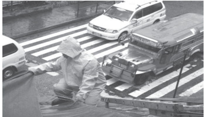
A City Environment and Parks Management Office laborer repairs a temporary office of the City Treasurer's Office where a tarpaulin is torn apart by Super typhoon Juan.