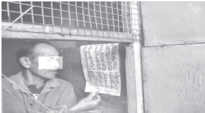
Above Photo taken at Rajah Matanda St.