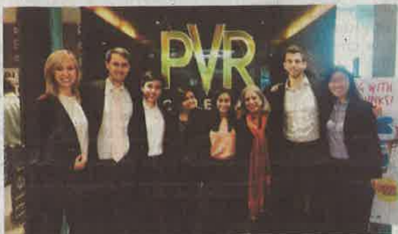
Harvard students at PVR Pictures.

The project is a mandatory part of the first year of Harvard Business School's MBA course in which stu-