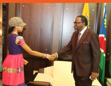
Welcomed to Namibia by President Hage Geingob

«Remember [thoughtfully] also your Creator in the days of your youth [for you are not your own, but His], before the evil days come or the years draw near when you will say [of physical pleasures], "I have no enjoyment and delight in them" Ecclesiastes12:1 (AMP)