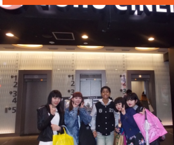
Zuriel Oduwole After film show in Tokyo