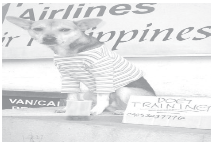
EYE CATCHING ADZ - An enterprising owner of this pet dog becomes the center of attraction of passing pedestrians along Session Road to advertise his profession as dog trainer.

“This way,” the alderman added, “They will pay their income taxes here and this will translate to more revenue for the city and more services for the people of Cont. on page 10