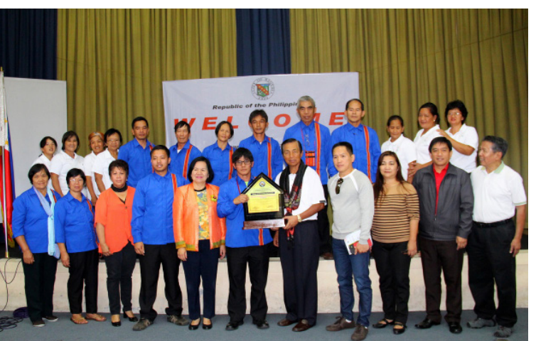
"TOP BARANGAY" - Mayor Mauricio Domogan hands over the Plaque of the 'Best Performing Barangay' to Officials of Middle Quirino Hill Barangay for topping this year's Search for the Best Performing Barangay".

The senator noted how employers, particularly of financially-distressed firms and small and medium businesses, shun paying the accumulated delinquency penalties because they are bigger than the principal that should have been settled. Office of Senator Chiz