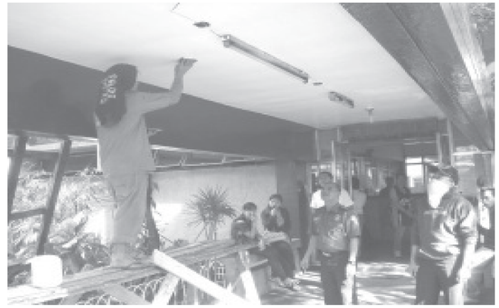
BCPO FACELIFT - Baguio City Police director PSSupt David Q. Lacdan inspects the work being undertaken for the rehabilitation and repair of baguio City Police Conference Room, firing range and its frontage funded by the city government worth P3million./Bong Cayabyab

"We should take the total ban of firecrackers even more seriously. We should ban all kinds of firecrackers that cause deaths, also the indiscriminate discharge of firearms," Quirino stressed./JDP/JBZ PIA CAR