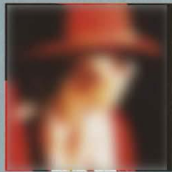
Stevie Ray Vaughan