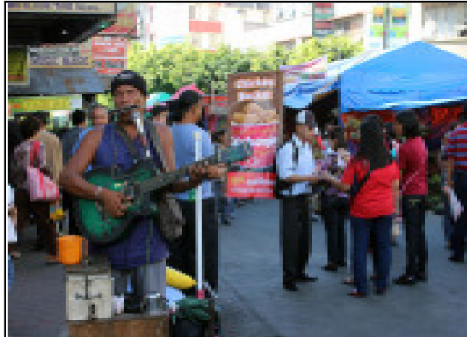
PERFECT SPOT - A mendicant belts out a song accompanied by his electronic musical instrument before passersby during the Session Road In Bloom.

EMB, NGO, City Inks Ties in River Rehab.....p2