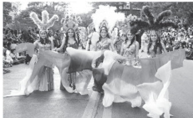
The Best of Pangabenga 2013.