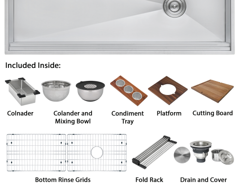
Bottom Rinse Grids