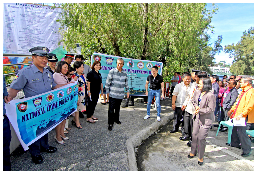
CRIME PREVENTION MONTH - City Officials headed by Mayor Mauricio Domogan and Vice Mayor Bilog assisted by Baguio City Police director Ramil Saculles unfurl the calendar of activities in observance of the 23rd National Crime Prevention Week during City hall flag raising ceremonies.

Reyes explained that the new priority activ-