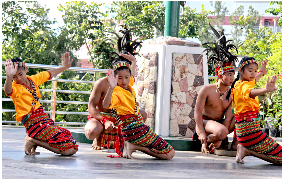
CONSISTENT ALIWAN FIESTA CHAMPION - Members of the Pinsao National High School Sakusak Musical Ensemble show of their winning form in performing native dances during the launching of 108th Baguio Charter Day Anniversary themed: “Land of Champions” during City hall flag raising ceremonies August 29 . The group won three consecutive times (2015, 2016 and 2017) as the best Folkloric Performance award during the Aliwan Festival 2017 in Metro Manila .

But the mayor said the development of certain portions of Burnham Park for income generation is allowed under Executive Order No. Cont. on page 5