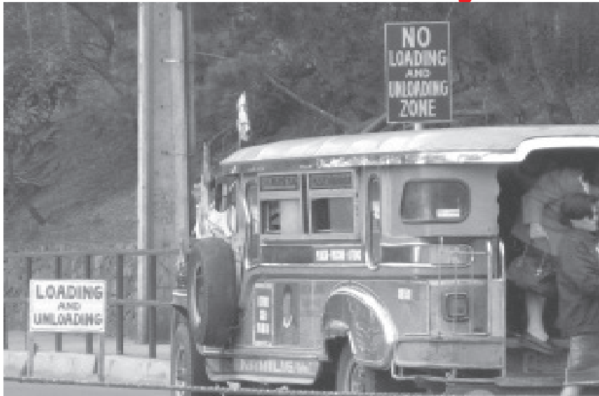
SO, WHICH IS WHICH? Conflicting signs at the top of Session Road continue to puzzle public utility vehicles as the local government continues to find solution to the city's worsening traffic woes.

BAGUIO CITY-Environmental groups on Tuesday frowned on government's mining boom figures claiming the massive invasion of foreign mining firms in the country would accordingly trigger a tidal wave of environmental and social catastrophes.