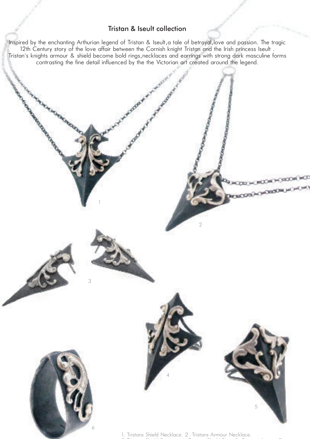
1. Tristans Shield Necklace. 2. Tristans Armour Necklace. 3 Tristans Shield Earrings. 4. Tristans Shield Ring. 5. Tristans Armour Ring. 6. Tristans Knights Ring.

Inspired by the enchanting Arthurian legend of Tristan & Iseult, a tale of betrayal, love and passion. The tragic 12th Century story of the love affair between the Cornish knight Tristan and the Irish princess Iseult. Tristan's knights armour & shield become bold rings, necklaces and earrings with strong dark masculine forms contrasting the fine detail influenced by the the Victorian art created around the legend.