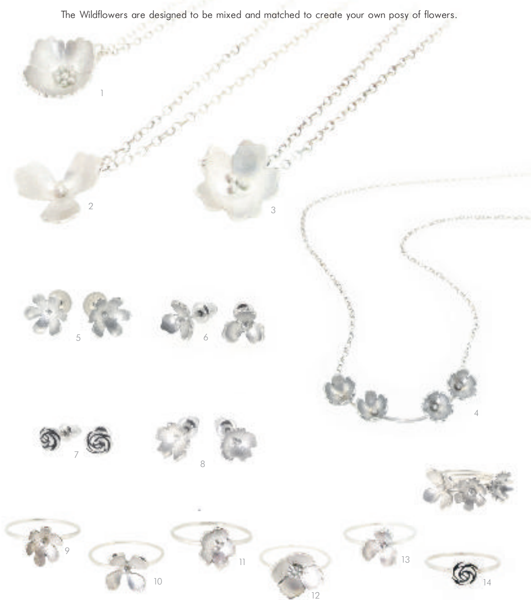
1. Wild Rose Pendant. 2. Trillium Pendant. 3. Pansy Pendant. 4. Daisy-chain Pendant. 5. Daisy Earrings. 6. Trillium Earrings. 7. Rosebud Earrings. 8. Pansy Earrings. 9. Daisy Stacking Ring. 10. Dames Rocket Stacking Ring. 11. Pansy Stacking Ring. 12. Wild Rose Stacking Ring. 13. Trillium Stacking Ring. 14. Rosebud Stacking Ring.

The Wildflowers are designed to be mixed and matched to create your own posy of flowers.