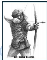
Bell Beaker Bowman Illustration from David Reich's NW Bell Beakers