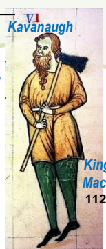
King Dairmaid Mac Murchada 1126-1171AD