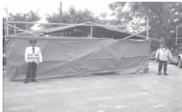
GUARDED CENTENNIAL TREASURE ? - Security guards look on as workers inside a makeshift structure in front of City Hall flag pole work on a Centennial Marker which will be unveiled this coming Baguio Centennial celebration on September 1.

Early this year, the city council ap- Cont. on page 10