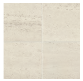
Polished & Honed