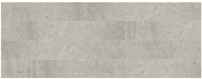
24" x 24", 12" x 24" & 4" x 12" - 8" x Free Length Pattern - Polished & Honed*