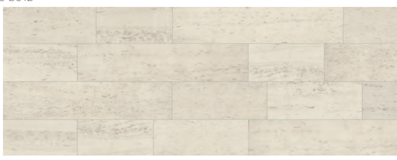
24" x 24", 12" x 24" & 4" x 12" - 8" x Free Length Pattern - Polished & Honed*