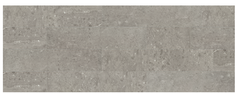
24" x 24", 12" x 24" & 4" x 12" - 8" x Free Length Pattern - Polished & Honed*