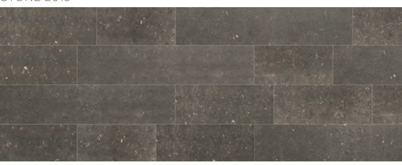
8" x Free Length Pattern – Honed & Brushed-and-Flamed*