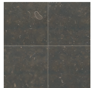
24" x 24", 12" x 24" & 4" x 12" -Honed & Brushed-and-Flamed