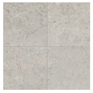
Polished & Honed