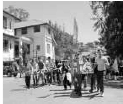
"TEAM WORK" - different emergency responders of the city participate in the amazing race during the 18th Anniversary of the Baguio City Emergency Medical Services (BCEMS)/Photo by Paul Rilloria

AI is a global movement which campaigns fair distribution and full protection of human rights and assurance of enjoyed human rights by all people. /JDP/Pryce E. Quintos and Engelbert S. Nievera – PIA/ UB Intern