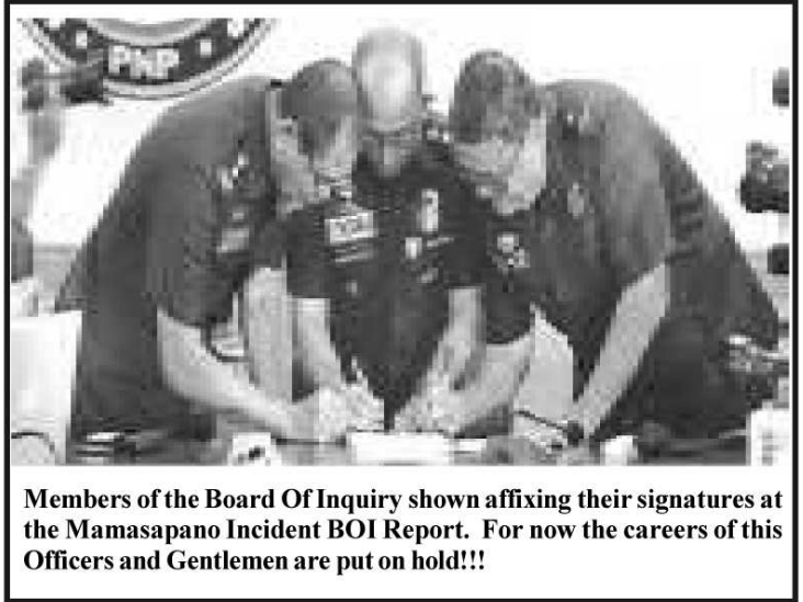
Members of the Board Of Inquiry shown affixing their signatures at the Mamasapano Incident BOI Report. For now the careers of this Officers and Gentlemen are put on hold!!!