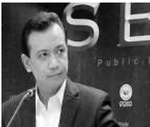
Senator Antonio Trillanes in a press conference linking the allegedly bribed/ paid Court of Appeals Justices. Does he have factual basis or is this just part of a grand demolition job against the Binays? !?!