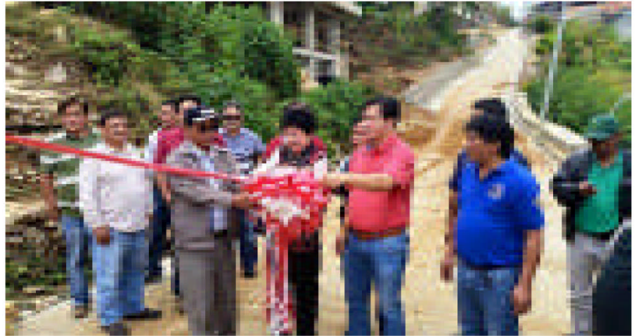
Congressman Nicasio Aliping in red shirt (third from right) shown cutting the ceremonial ribbon on the inauguration of the newly constructed farm-to-market road at San Luis Barangay. Just one among the numerous socially beneficial projects of the office of Congressman Aliping.

According to Casanova, CJHDevCo is trying to mislead the sub-lessees so it can escape its liabilities. He pointed out that the Sobrepeña-led CJHDevCo is clearly liable and accountable and should rightfully pay the sub-lessees for the portion of their contract that CJHDevCo will not deliver because of the Philippine Dispute Resolution Cont. on page 9