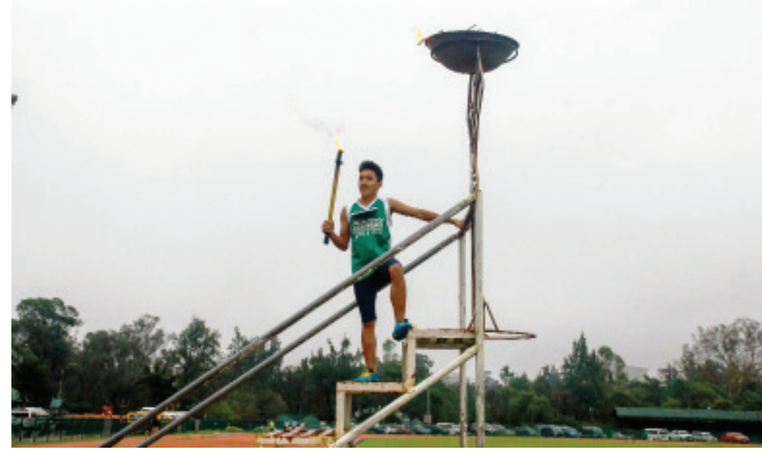
PWD OLYMPICS - Around 400 students with disability from different schools in Baguio City join the annual Olympics for PWD held at the Athletic Bowl on Thursday conducted by the City Government of Baguio through the City Social Welfare and Development Office (CSWDO) and Persons with Disability Affairs Office (PDAO) in coordination with the different schools in the city catering to PWDs.

However, the city's judo Cont. on page 3