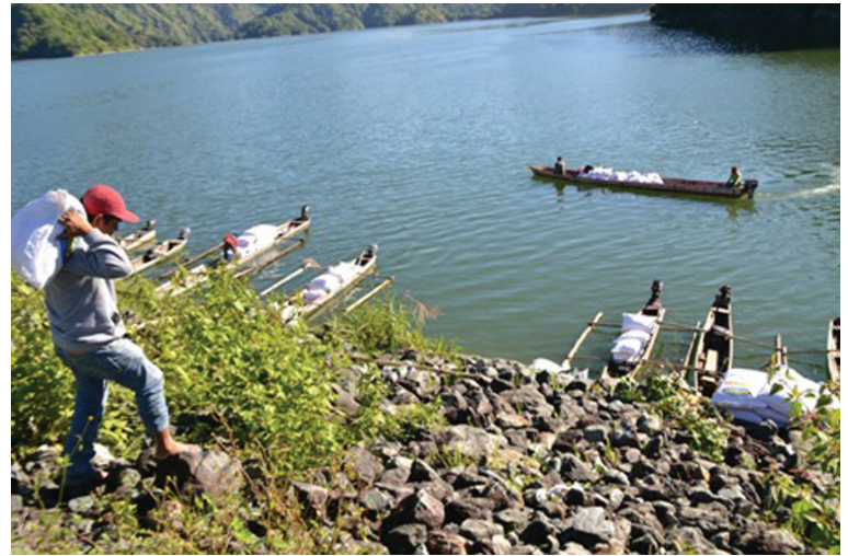
Fisherfolk of Bokod in Benguet load down fish food supplies for their 'tilapia' in their fish cages in Ambuklao Lake. The Ambuklao tilapia is said to be the best in the country.

Sports tournament in arnis, mixed martial arts, airsoft, dama, shootfest, football and badminton and a taekwondo exhibition are also part of the celebration.