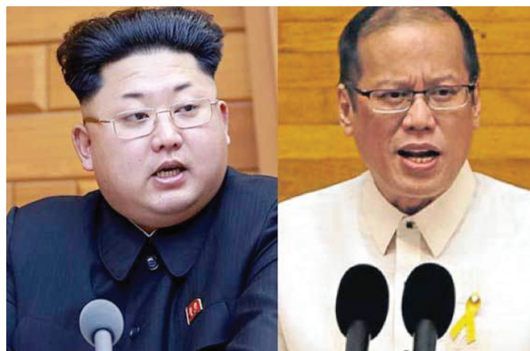
North Korean leader Kim Jong-un and President Benigno Aquino 3rd: Other than owing their posts to their parents, they now have something else in common.