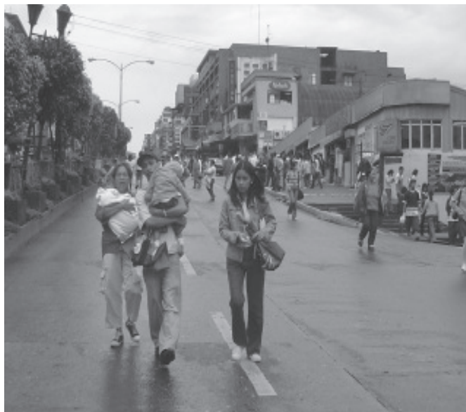
CAR-FREE SESSION ROAD - People from all walks of life enjoy the sight of Session Road's "Car-less Sunday," July 13, which is an offshoot of the "Walk, Baguio, Walk" advocacy piloted by the City Government and the Baguio Regreening Movement./By Bong Cayabyab

The town is also expecting to collect some amount from the real property taxes of the turnover of Binga and Ambuklao dams. SN Aboitiz Power Hydro Inc. now operates both dams which according to Godio is now the eighth time the operations were turned over./S. C. Aro/PIA-Benguet