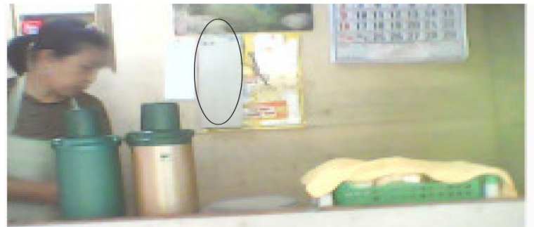
Tayaan sa Dangwa Bus Station