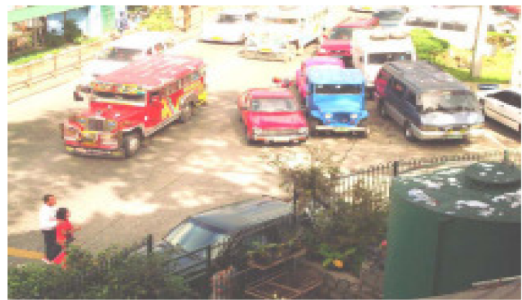
TRIPPLE PARKING - Knuckle-headed vehicle owners illegally park their vehicles even along the pedestrian crossing to the detriment of the public along Yandoc Street.