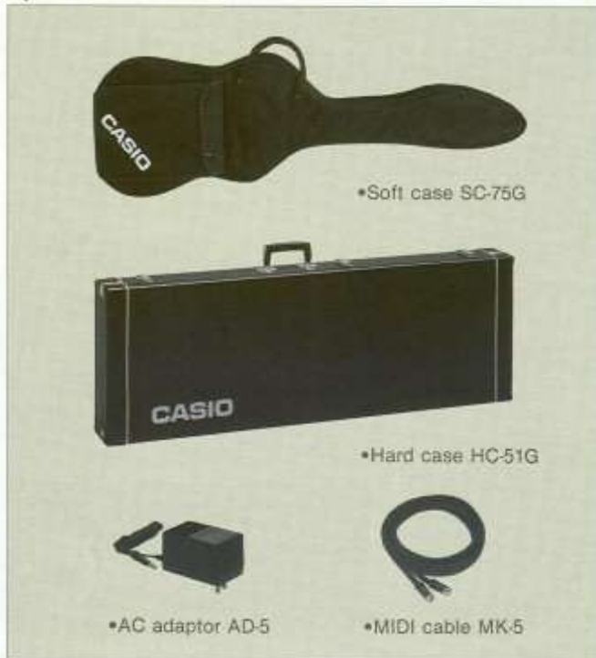
•Soft case SC-75G