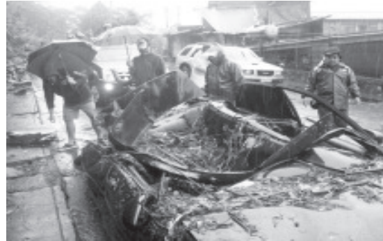
A car was wrecked by an eroded riprap along Ambuklao Road. A van was also slightly damaged on the said area.

Cayetano is set to deliver the traditional Contra-SONA speech of the Minority Leader at the Senate session hall on Monday./ Office of Senator Alan Peter Cayetano