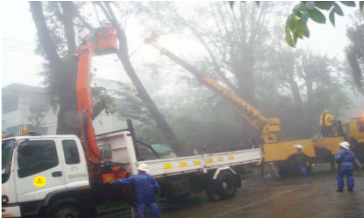
ZERO CASUALTY - Combined elements from Benguet Electric Cooperative, City Disaster Risk Management Council, various radio communication and rescue groups, other volunteers and men in uniform work hand-in-hand to save lives and properties leading to "Zero Casualty" in the city at the height of typhoon Gener. Photo shows BENECO linemen and volunteers jointly cut a pine tree about to fall endangering a building and electrical wires.

MABUHAYANG PILIPINO!!! BAGUIO CITY, AND LA TRINIDAD, BENGUET LONG LIVE THE FILIPINO!!!