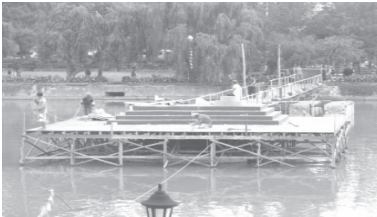
VALENTINE RUSH... personnel from the city government are doing the final touches of the stage at the center of the Burnham lake which would be used come valentines' day as part of the Panagbenga activities.

Senator Chiz Escudero on Monday said that the World Bank had furnished the three contractors who figured in the alleged bid-rigging activities on road contracts a "more detailed" report of the investigation into the collusion.