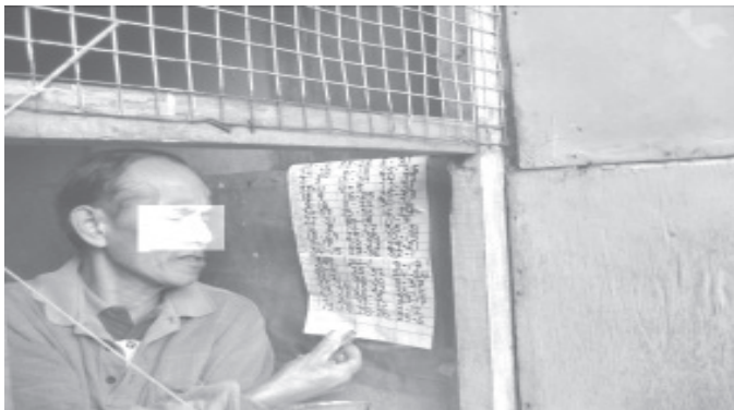
Above Photo taken at Rajah Matanda St.