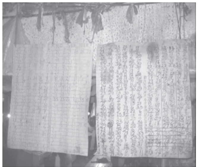
Above Photo taken at Meat section, public market

As proposed, the estimated income will come from the beginning balance of P100,000,000; local taxes amounting to P257,800,000; permits and licenses – P14,800,000; service income – P40,150,000; business income – P59,890,000; other income of P154,500,00 and Internal Revenue Allotment – P323,000,000. / aileen p. refuerzo