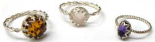
Gemstone Ring For experienced crafters