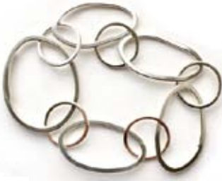
Silver Chain Necklace or Bracelet