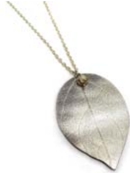
Silver Leaf Pendant