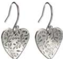
Silver Texture Drop Earrings