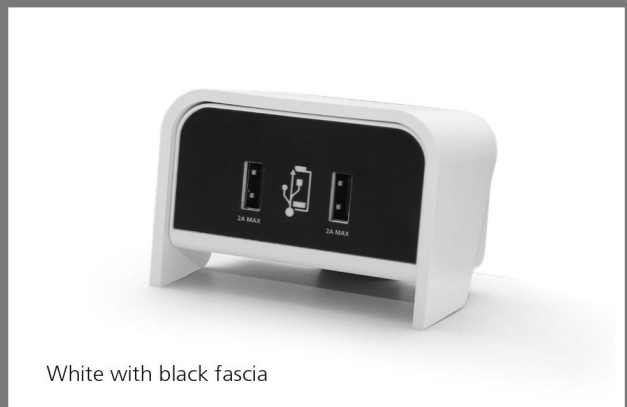
White with black fascia