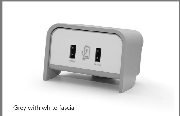
Grey with white fascia