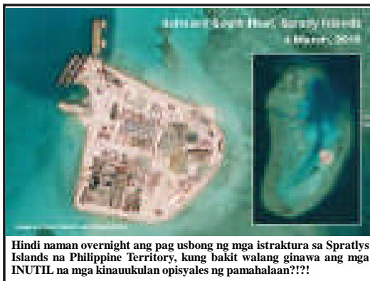
Hindi naman overnight ang pag usbong ng mga istraktura sa Spratly Islands na Philippine Territory, tung bakit walang ginawa ang mga INUTIL na mga kinaaukulan opisyal ng pamahalaan??!!