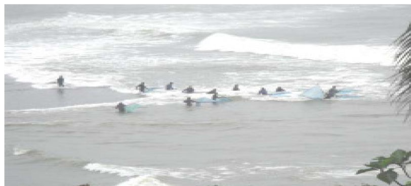
FINGERLING FISHERMEN. In spite of the tsunami scare in Japan, fisher folks in Claveria, Cagayan brave some rough waters to catch their favorite fingerlings along the shorelines of the beach.

Rabanes revealed city letters are in the works asking the Office of the Solicitor General (OSG) and DENR to step into the picture to protect national and city interests over the properties. /isl