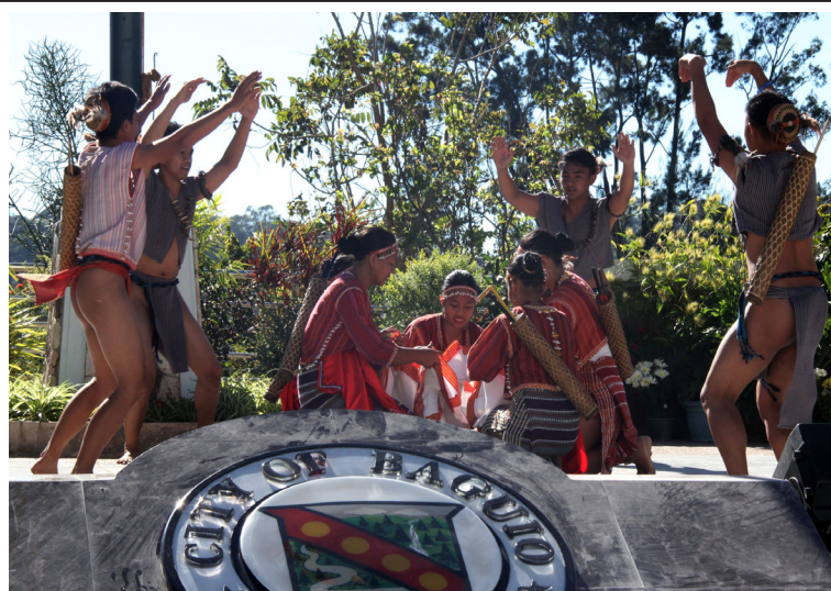
PANAGBENGA 2016 LAUNCHING Members of the University of the Cordilleras Hapiyoh Mi Cultural Group performs the tribal dances of the Cordillera region during the launching of Panagbenga 2016 with the theme "Bless the Children with Flowers" at City Hall grounds November 16.