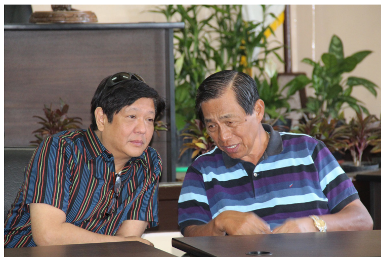
Senator Ferdinand 'Bong Bong' Marcos and Mayor Mauricio Domogan discuss issues during a brief visit by the Senator to the summer Capital Friday.