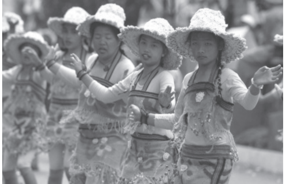
BAGUIO CITY -- Color and spectacle. "Street dancers in colorful traditional Igorot costumes adds up further to the spectacle of the Baguio Flower Festival or "Panagbenga" ( A Time To Bloom). "Already on its 13th year, perhaps the most attended festival in the country, at least 300,000 revelers queued to the streets here for the Panagbenga street dancing on Saturday.--Artemio A. Dumlaog

rest are Indians, Americans, Chinese, Japanese, Nepalese, Bangladeshis, and other nationalities.